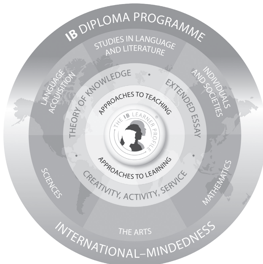
Figure 1 Diploma Programme model

The course is presented as six academic areas enclosing a central core (see figure 1). It encourages the concurrent study of a broad range of academic areas. Students study two modern languages (or a modern language and a classical language), a humanities or social science subject, an experimental science, mathematics and one of the creative arts. It is this comprehensive range of subjects that makes the Diploma Programme a demanding course of study designed to prepare students effectively for university entrance. In each of the academic areas students have flexibility in making their choices, which means they can choose subjects that particularly interest them and that they may wish to study further at university.